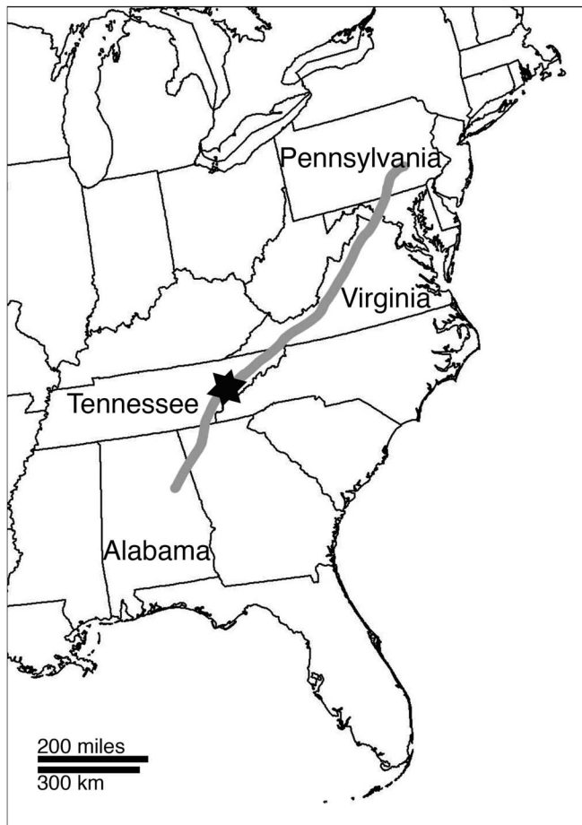
Figure 1. Map of eastern U.S.A. showing trend of Ediacaran to lower Cambrian Chilhowee Group (gray shading) in southern and central Appalachians. Star symbol indicates location of Chilhowee Mountain, Blount County, Tennessee, where the fossils discussed herein were collected.

(e.g., Walcott, 1910; stratigraphic divisions for the Cambrian of Laurentia follow Palmer, 1998). However, subsequent systematic revisions have greatly restricted the inclusivity of the genus (e.g., Palmer and Repina, 1993; Palmer and Repina in Whittington et al., 1997; Lieberman, 1998, 1999). With the recent reassignment of many species of “ Olenellus ” sensu lato to other genera, occurrences of Olenellus sensu stricto are apparently restricted to the mid- and upper Dyeran (provisional Cambrian Stage 4; Peng et al., 2012) (Webster, 2011 and references therein; Webster and Bohach, 2014). The historical records of “ Olenellus ” within the Chilhowee Group must, therefore, be re-evaluated in light of modern systematics in order to exploit their full biostratigraphic potential. Unfortunately, re-evaluation of the Murray Shale record is hampered by: (1) the absence of any description or illustration of specimens; and (2) the failure of subsequent workers to collect any additional trilobite material, despite concerted efforts. The lack of success is due in part to poor and confusing descriptions of field localities (see below) and the apparent rarity of specimens. Indeed, several workers have expressed doubt regarding the supposed stratigraphic provenance of the material reported by Walcott and Keith (see below).